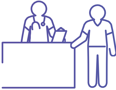
HEALTH ASSESSMENTS ON ALL EMPLOYEES AND VISITORS