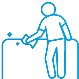
CLEANING ALL THERAPY EQUIPMENT AFTER EACH USE